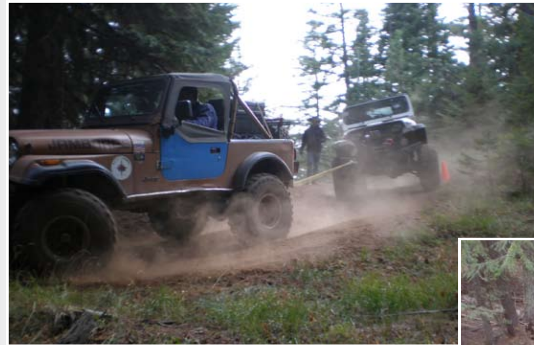
(Left) One of the events required towing one non running vehicle through a tight and twisty train.