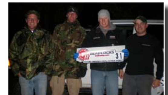
Team 31 after completing tech inspection and getting their official number signs.

After all the buckets were found, the points tallied, receipts added up and sleep recovered, the event was a resounding success for all involved. Despite the exhausting and often confounding effort, everybody on the PNWJeep teams is excited for next year and already comparing notes on ways to improve our performance.