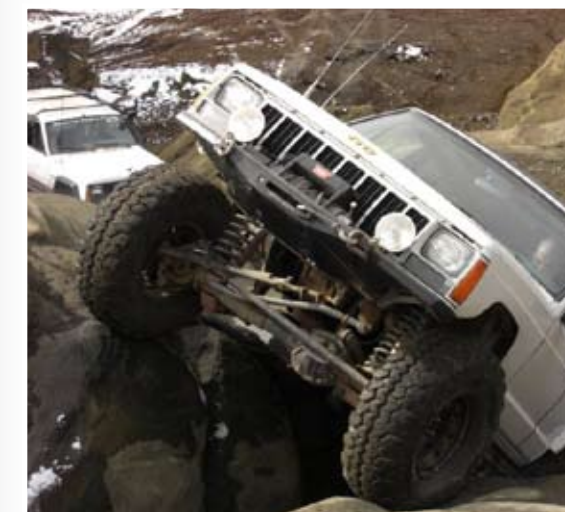
(Left) Jesse on The Crack. The rocks proved just a little too slippery that morning.

After careful consideration, we decided to send Jesse up a very difficult line called "The Crack." As the name implies, it's a very deep crack that requires you to straddle them in order to conquer. Sounds easy until you factor in the steep angle of the ascent. As you climb, all you can see is sky; spotters play a huge role. After a couple attempts and near event-ending rolls, it was deemed too icy and slick to be possible. Jesse backed down and followed me up one of the easier lines. Though denied by "The Crack," we completed the challenge in the allotted time, gaining us some points.