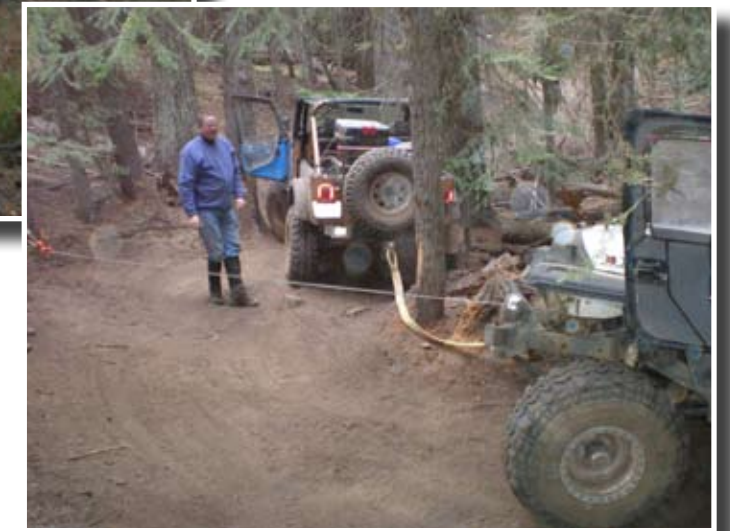
(Below) This challenge proved problematic for many teams

As the day wore on we gained familiarity with the directions and began to feel more confident with ourselves. We hit the first checkpoint/challenge early in the day; our task was to re-seat the bead on a tire and inflate it to between 20 and 25psi. If our tire was higher or lower than the prescribed pressure, we were disqualified. It was timed, points being awarded for the shortest time. We would run into similar exercises during the event.