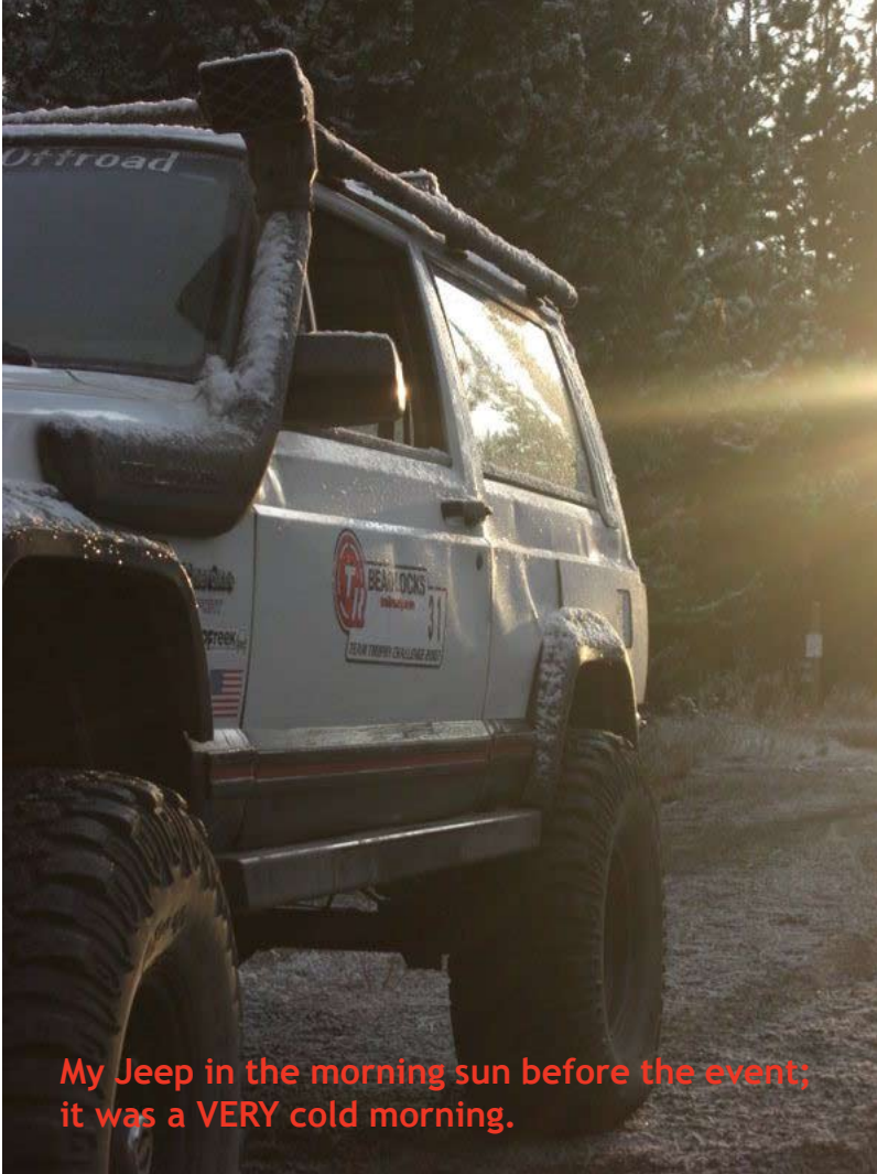
My Jeep in the morning sun before the event; it was a VERY cold morning.

We awoke early, about 5:30am, in order to have a hot breakfast and (lots of) coffee before going to the drivers meeting. Ian stepped up to the plate and fixed two huge pans of bacon and eggs (two dozen), in sort of a country scramble with onions. It may have been the best