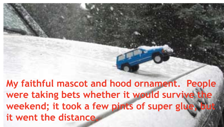
My faithful mascot and hood ornament. People were taking bets whether it would survive the weekend; it took a few pints of super glue, but it went the distance.

Uh...we quickly tore open our instructions and found a baffling combination of GPS coordinates and pictograms. I quickly dubbed them hieroglyphics as they bore no resemblance to any language I knew. The name stuck. We finally found our bearings and tore off down a trail we thought might be the right one. It wasn't, and we were forced to back track and start from scratch. This was the beginning of a long day for Team 31.