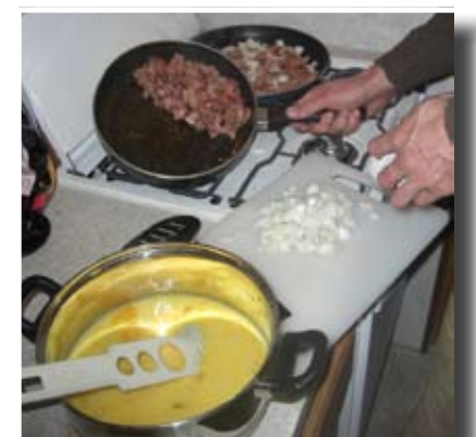
Ian fixing the two PNWJeep teams breakfast before the competition.

We awoke early, about 5:30am, in order to have a hot breakfast and (lots of) coffee before going to the drivers meeting. Ian stepped up to the plate and fixed two huge pans of bacon and eggs (two dozen), in sort of a country scramble with onions. It may have been the best